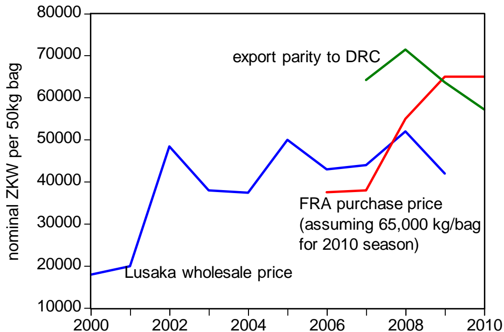
Figure 3: : Lusaka Wholesale, FRA Past Purchase Prices and Assumed FRA 2010 Price of 65,000 ZWK per Bag - May-October Average Maize Prices, Nominal Zambia Kwacha per 50kg bag