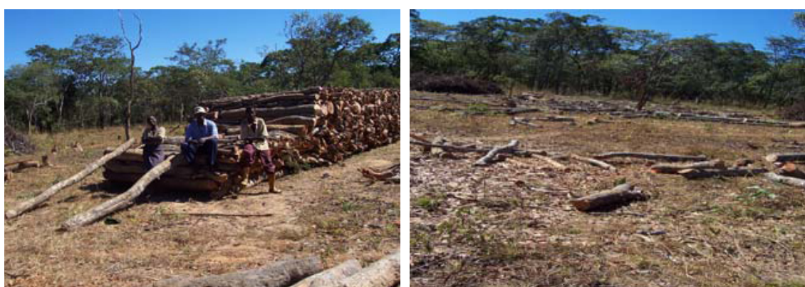
Figure 3. Cleared area and kiln for charcoal production.