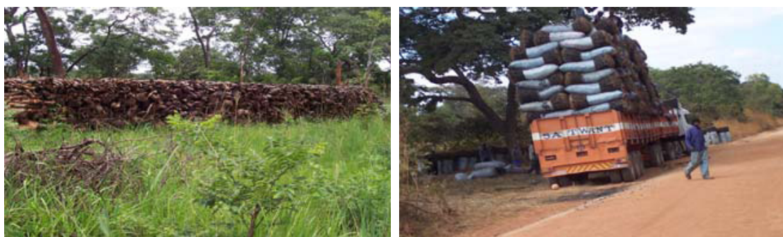
Figure 2. Charcoal kiln and the truck loaded with charcoal for onward transportation.

The increased demand for charcoal entails massive clearing of land for charcoal production (Fig. 3).